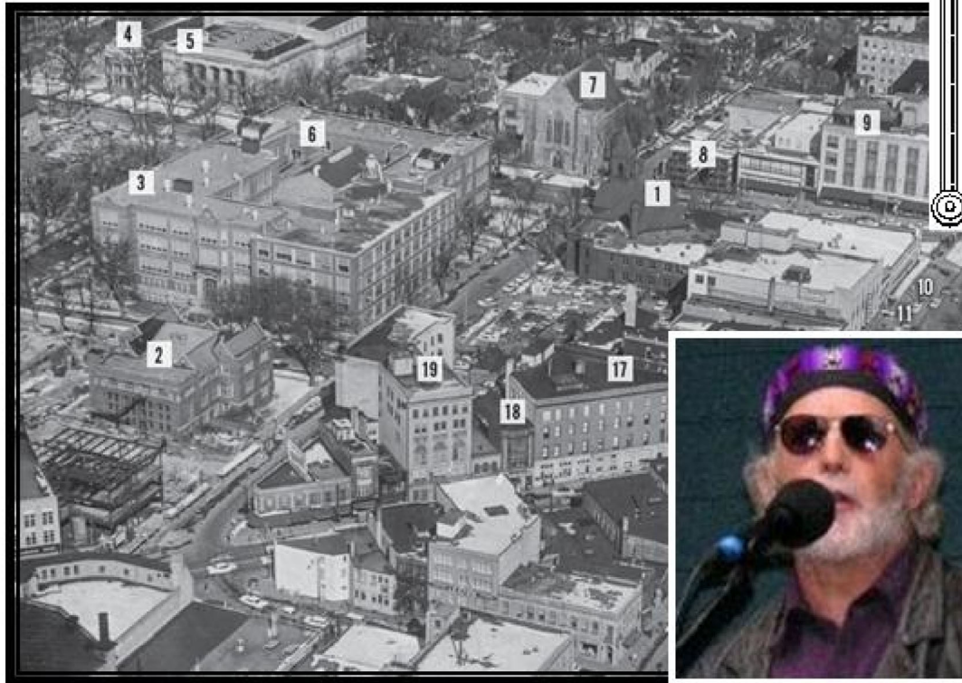
The razing of (1) Christ Presbyterian Church on August 12 initiates a downtown development fight that will take eighteen months to play out, while the October 29 groundbreaking for a new library sets a final due date for (2) the 1906 Carnegie Library. Also pictured: (3) Vocational School, (4) First Church of Christ Scientist, (5) Masonic Temple, (6) Central High School, (7) First Methodist Church, (8) Manchester's pigeon-hole parking, (9) Manchester's department store, (10) Woolworth's, (11) Chandler's shoes, (12) Baron's department store, (13) Baron's shoes, (14) the Hub men's clothier, (15) Wisconsin Life Insurance building, (16) Rendall's women's clothier, (17) Commercial State Bank, (18) Anchor Savings and Loan, (19) YWCA. WHEIMAGE ID 137506, PHOTO BY JOHN NEWHOUSE